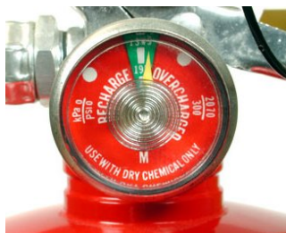
Figure 2 Pressure Gauge in Correct Position